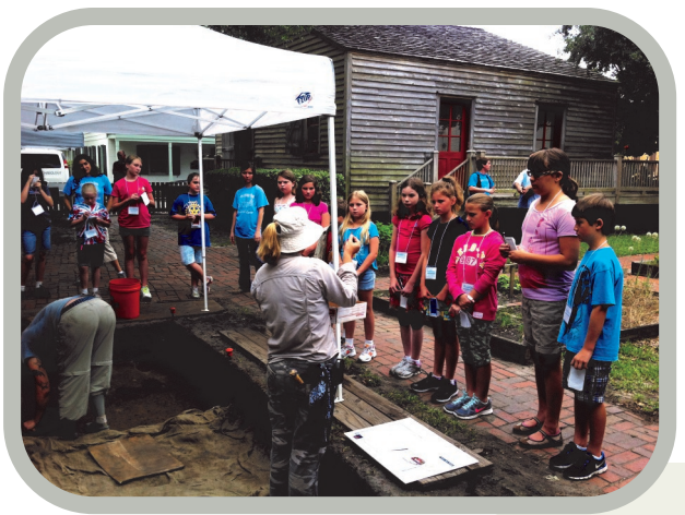
Last year's campers explore an active archaeological excavation conducted by the University of West Florida in downtown Pensacola.

Historic Pensacola Village will highlight history from the Colonial Period through modern day. Throughout camp, students will apply reading, writing, science, math, and reasoning skills in fun real-world applications.